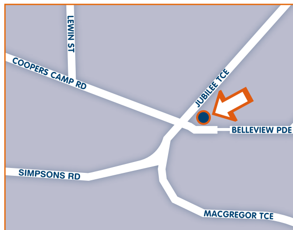
We are located here